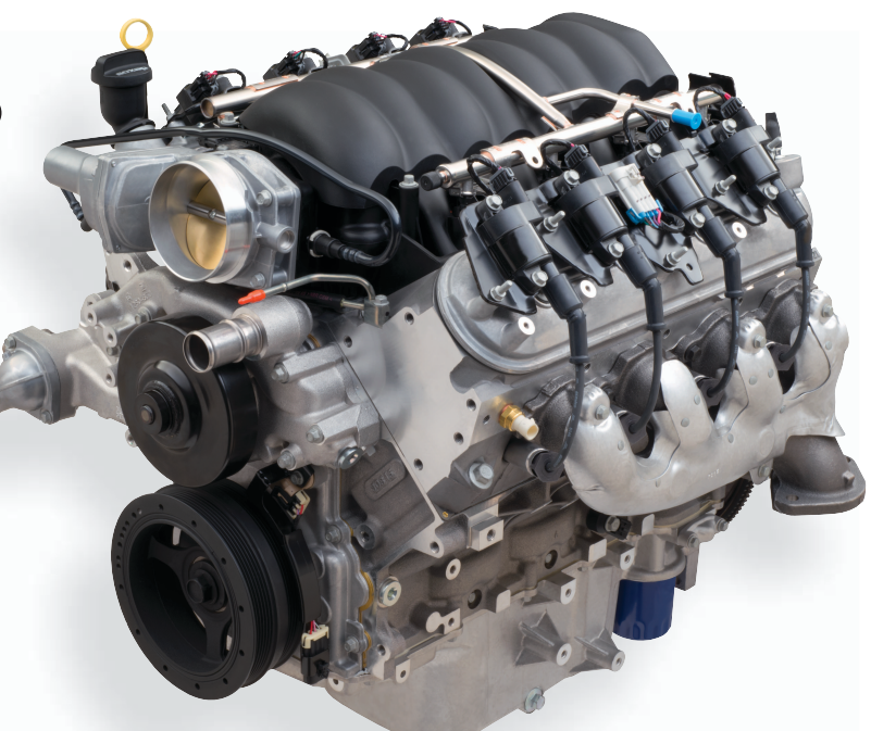
Crate Engine Only: See Site for Pricing

Not all items shown are included in all crate engine levels. Prices subject to change. See dealer for details.