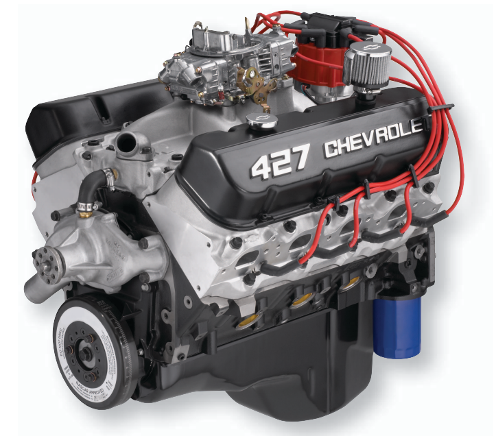
Crate Engine Only: See Site for Pricing

Not all items shown are included in all crate engine levels. Prices subject to change. See dealer for details.