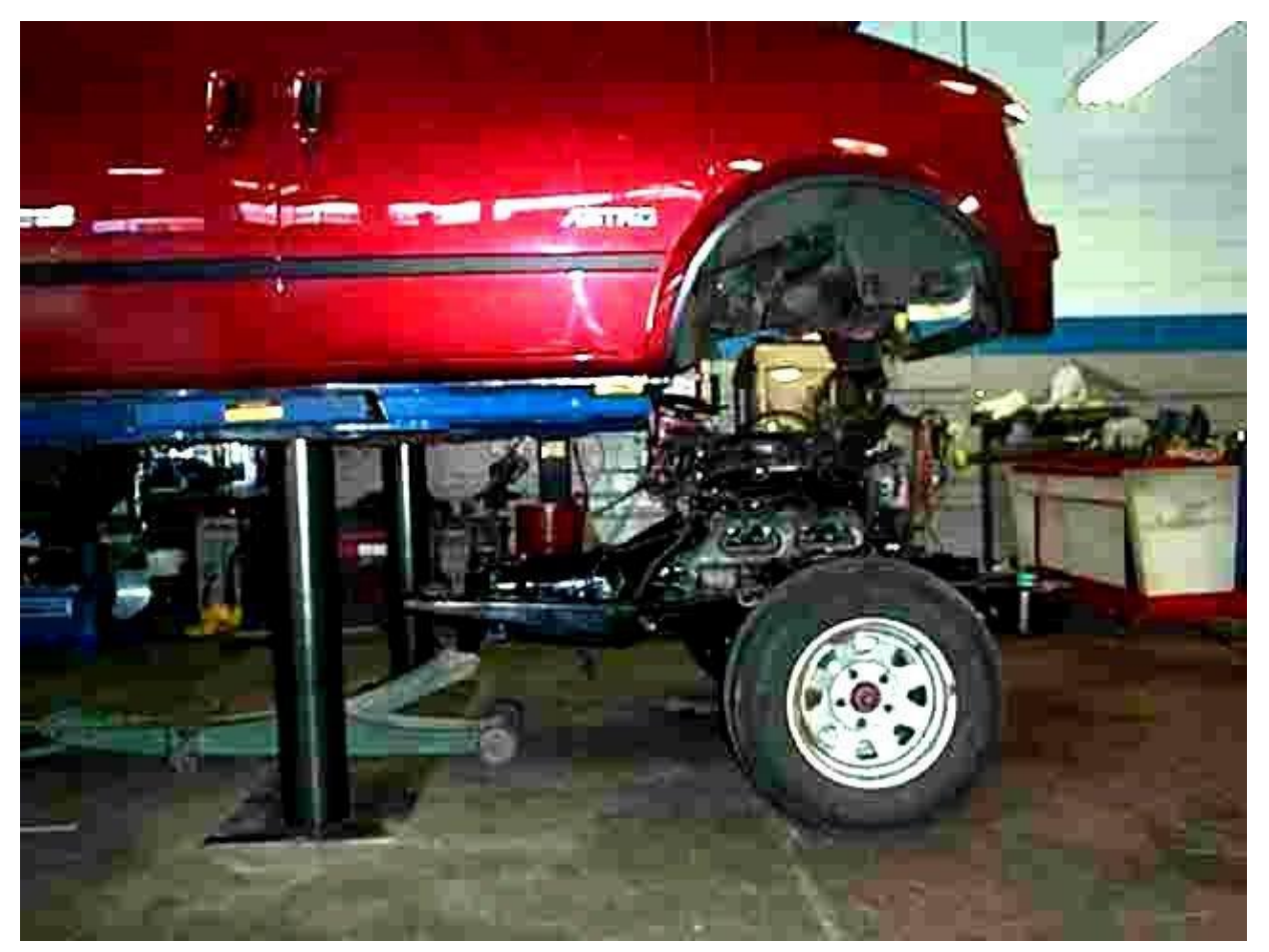
Subframe ready for install