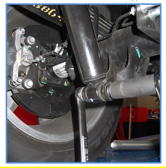
IMPORTANT: Read all instructions thoroughly from start to finish before beginning the install. Check parts list and make sure all parts are included in the kit. If the instructions are not properly followed severe frame, driveline and/or suspension damage may result. Check for frame and suspension damage prior to installation.