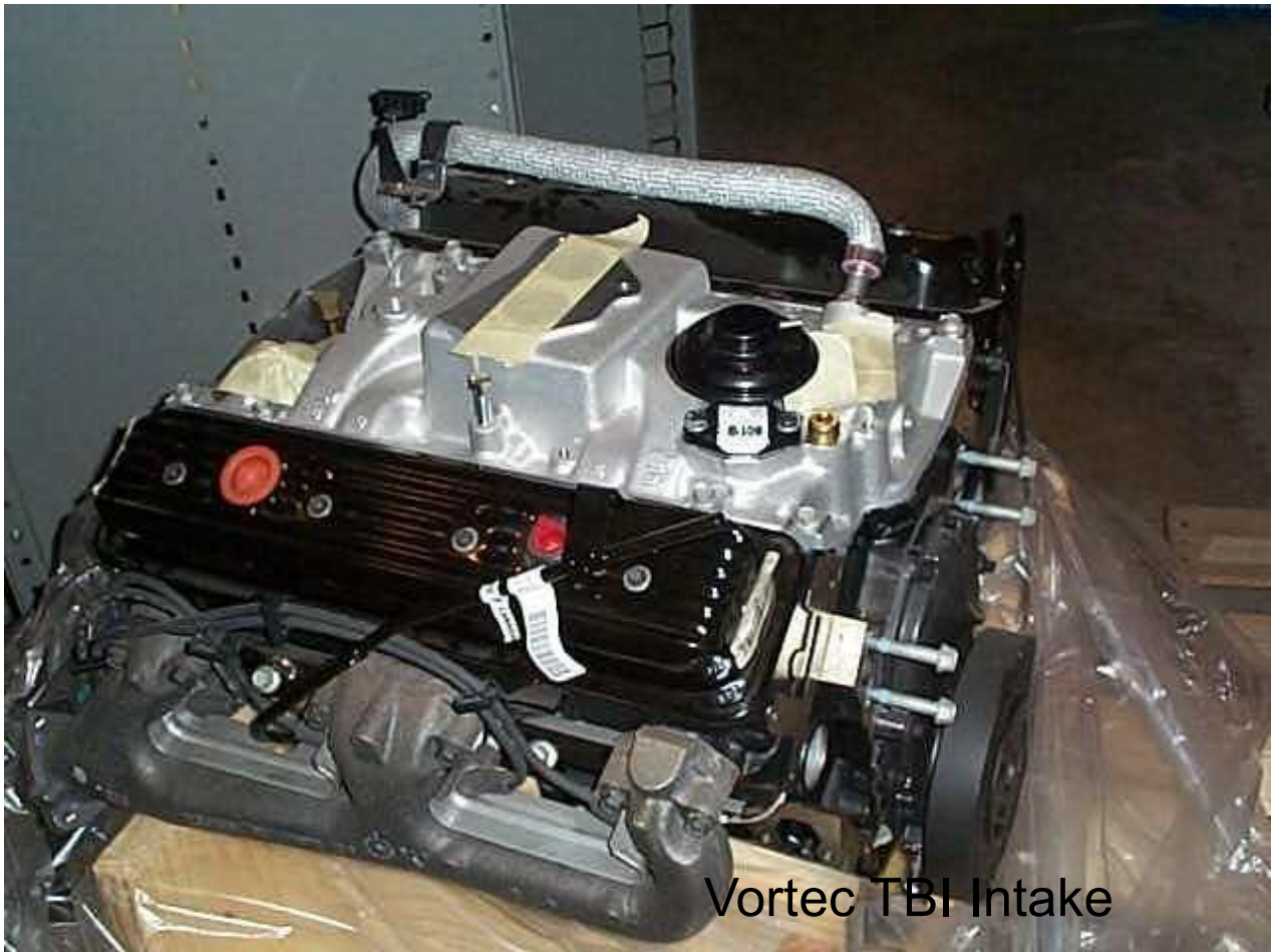
Vortec TBI Intake