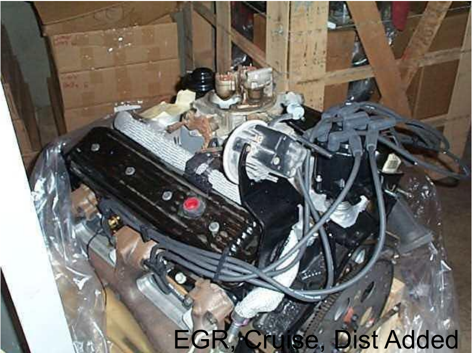
EGR, Cruise, Dist Added