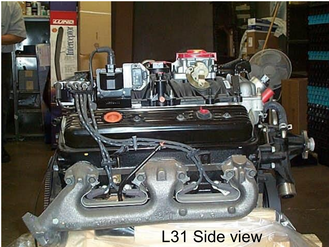
L31 Side view