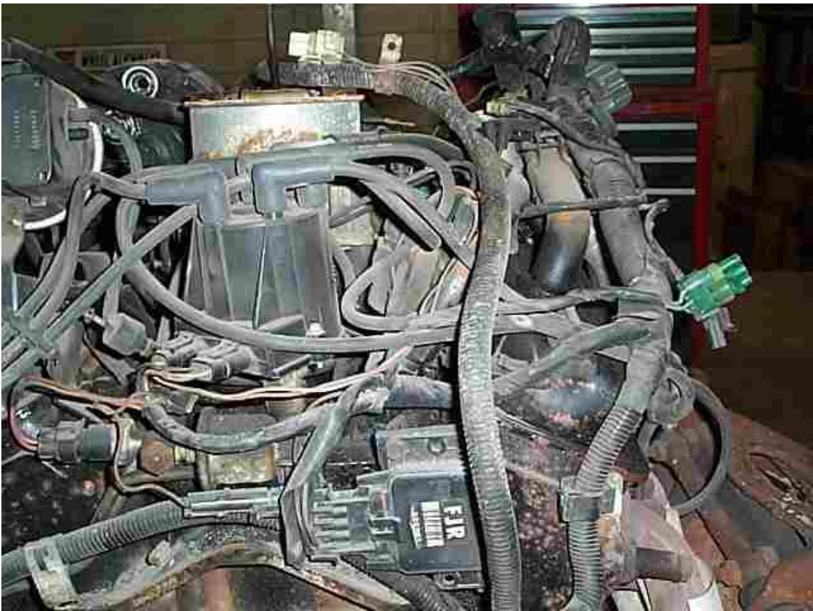
V6 Still sitting in subframe