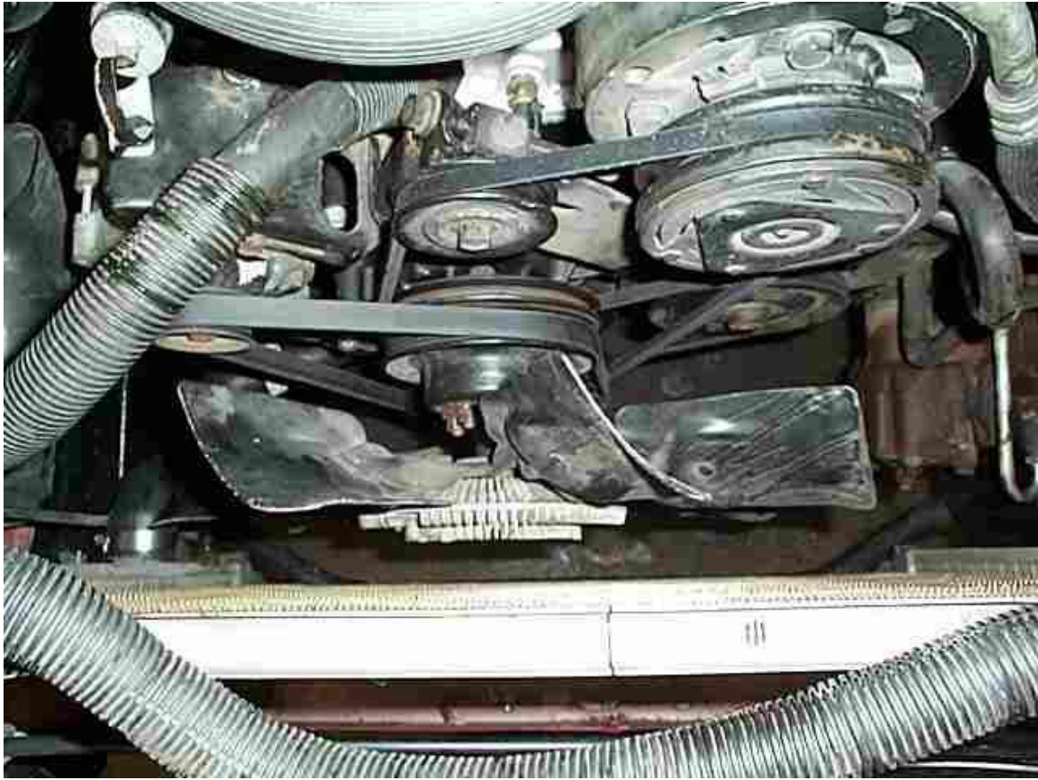
Fan Clearance with V8