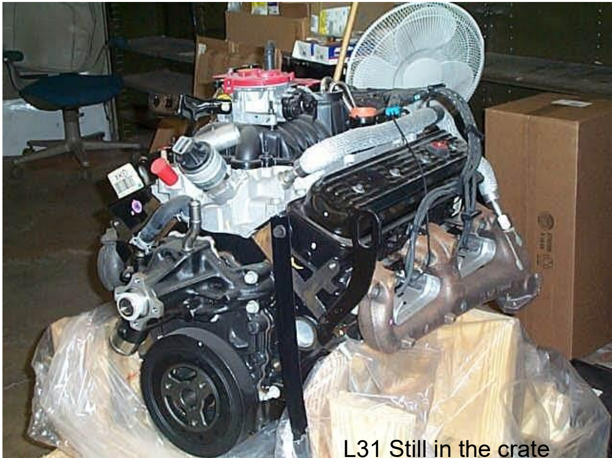
L31 Still in the crate

This page is the start of a L31 swap into a 1986 Astro with 97K miles on it. I purchased the production L31 with the hopes of doing a 4.3Z to a L31 adding more than 100 more HP under the hood. The engine swap was completed March of 2004