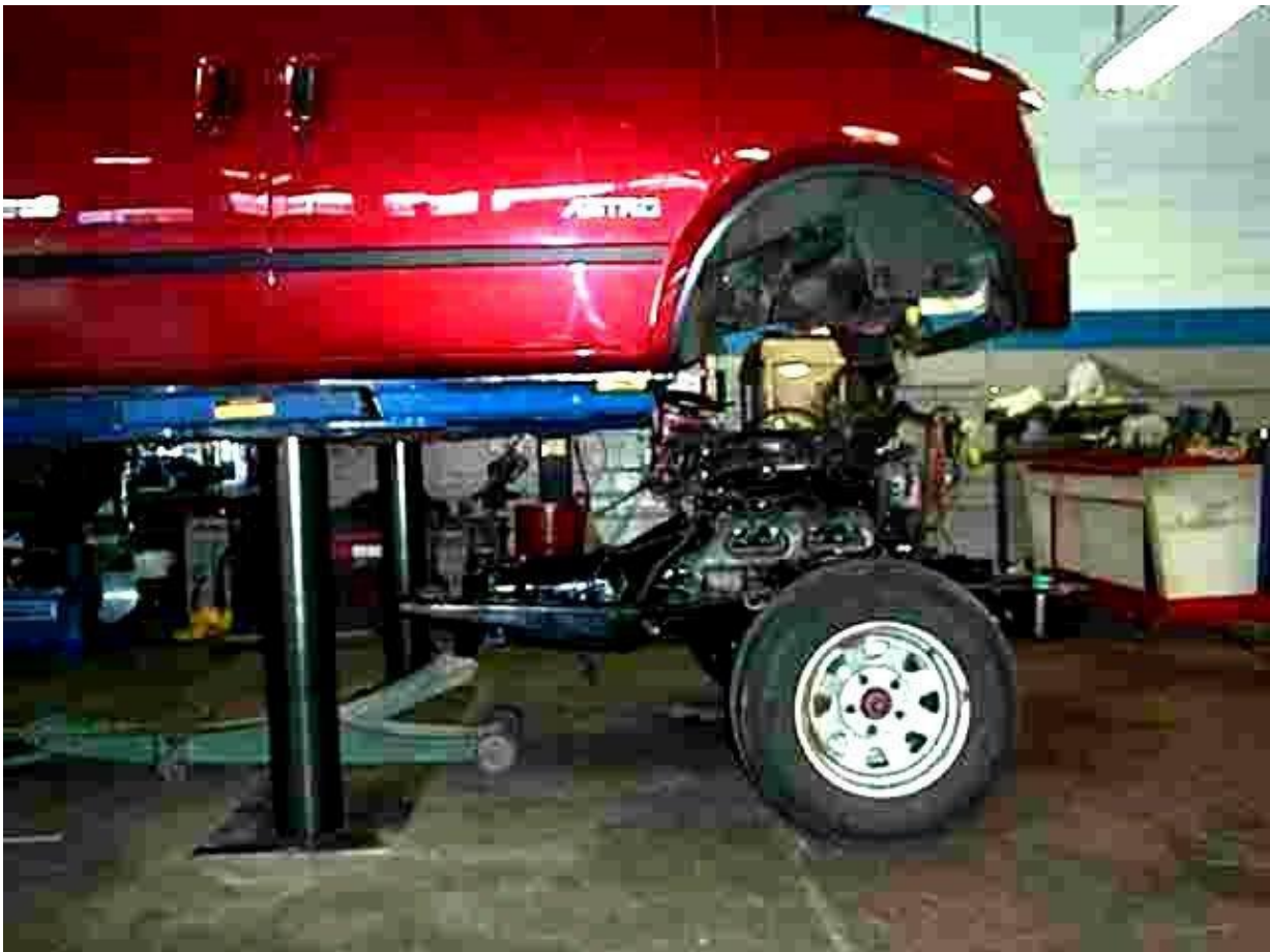
Subframe ready for install