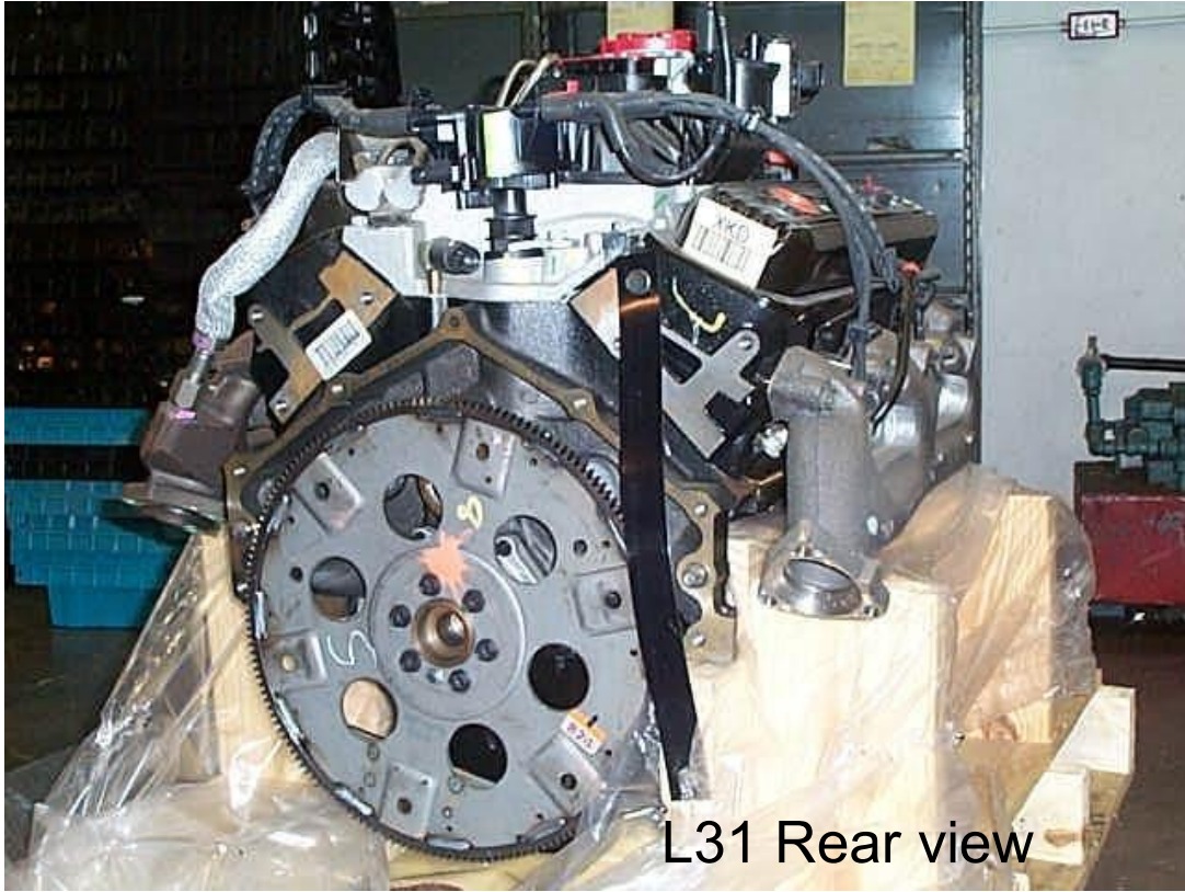
L31 Rear view